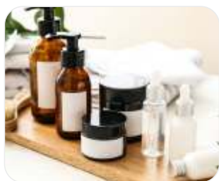
Personal Care Products