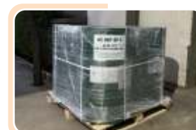
Pan India Distribution