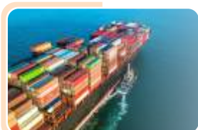
Import of Material