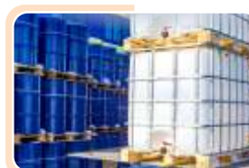
Direct Delivery to Customers