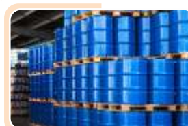
Drumming & Storage