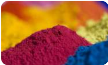
Dyes & Pigments