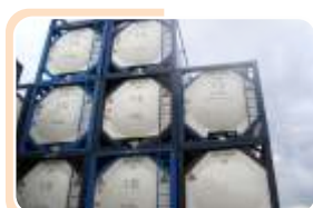
Bulk Storage at Port